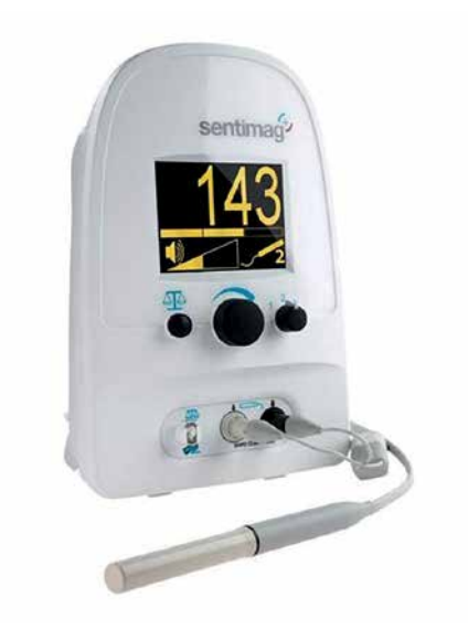
Figure 4. Handheld Sentimag magnetometer