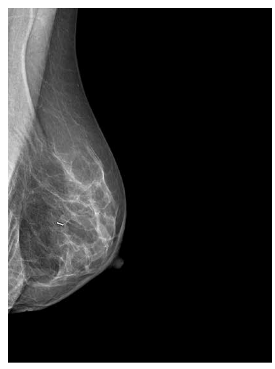
Figure 3. Mammogram with Magseed implementation at the site of the breast tumour (University Hospital Ostrava)

tected by a handheld magnetometer, SentiMag (Endomagnetics, Inc.) (Figure 4) at a distance up to 30 mm away [17, 18]. If the Magseed is placed deeper than 30 mm, it may not be detectable, but using palpation with a probe, which means tissue compression, deeper Magseeds are possible to detect. The Magseed may be implanted safely up to 30 days before surgery, but ongoing clinical trials are currently investigating a longer implantation